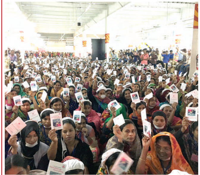
The RSC protects workers' right to a safe workplace.