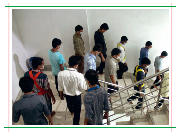
When you hear a fire alarm, exit the factory quickly and solely. Do not panic. Do not run.

It is important that you know where the exits are. The exit doors must be unlocked and free of obstacles.