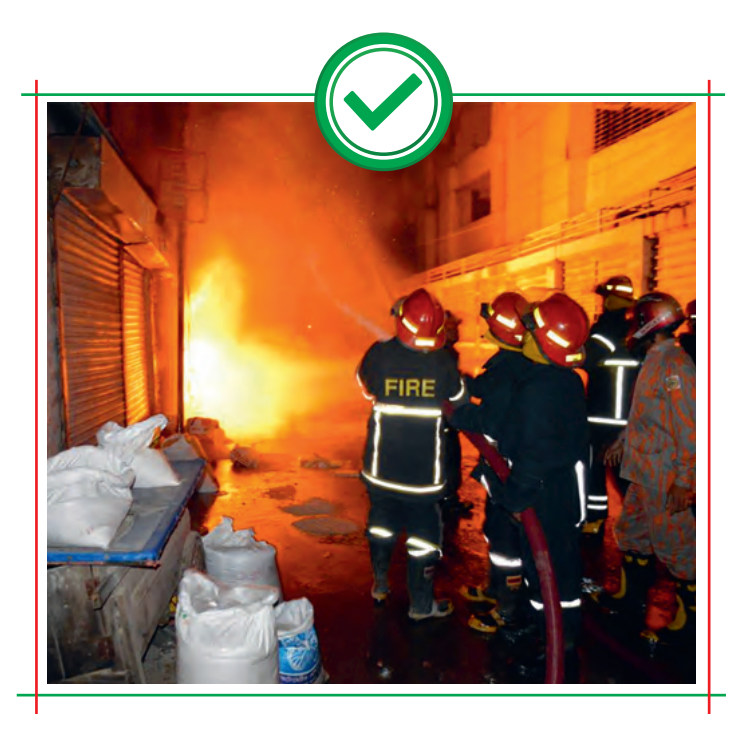
Your job is to safely exit the factory. The Fire Service will put out the fire.