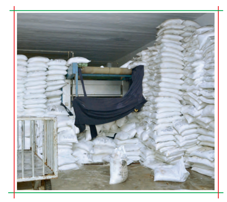
Putting too much weight on a floor can lead to the collapse of the floor or even the building.

If you see any cracks or slants in the walls or floors, notify the Safety Committee. A structural engineer can make an accurate assessment and determine if the building needs repair.