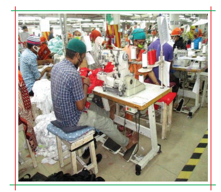
Ergonomic hazards are determined by how your work is organised or how your work station is set up.