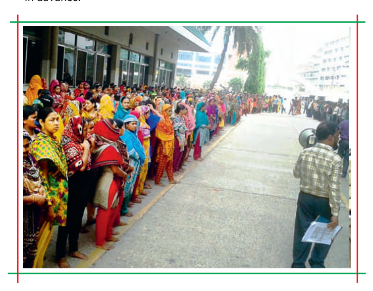
Fire drills allow you to see if a safe and orderly evacuation is possible.

Your factory should have fire drills - which are not announced in advance.