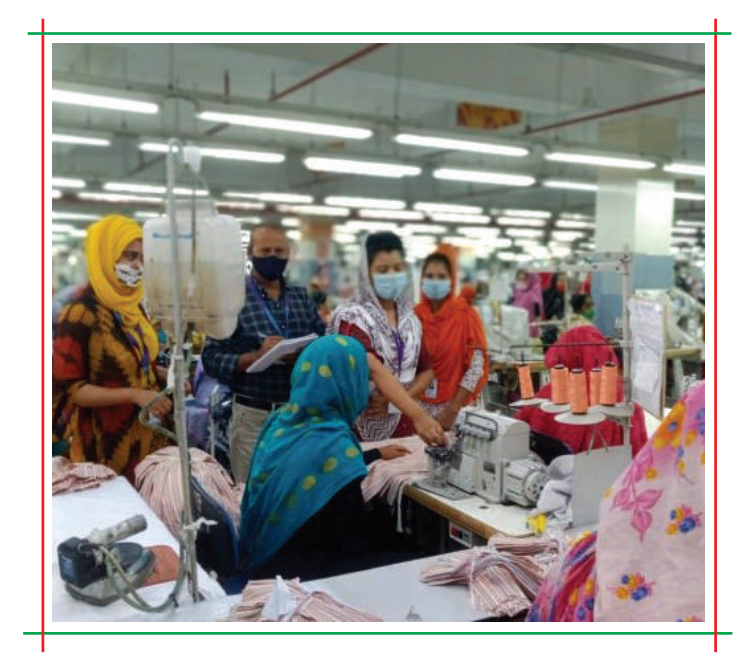
When you see a hazard, tell someone on the Safety Committee about it.