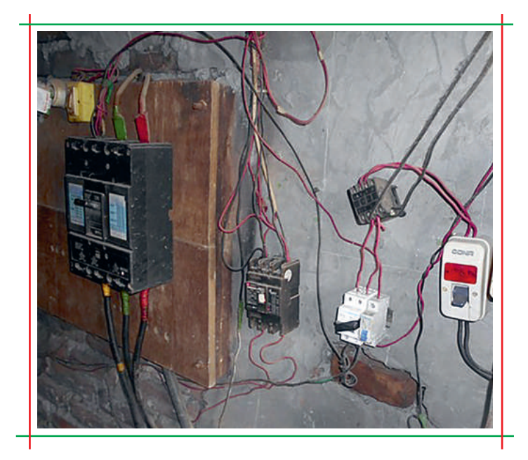
Overloaded outlets can cause electrical short circuits or fires.