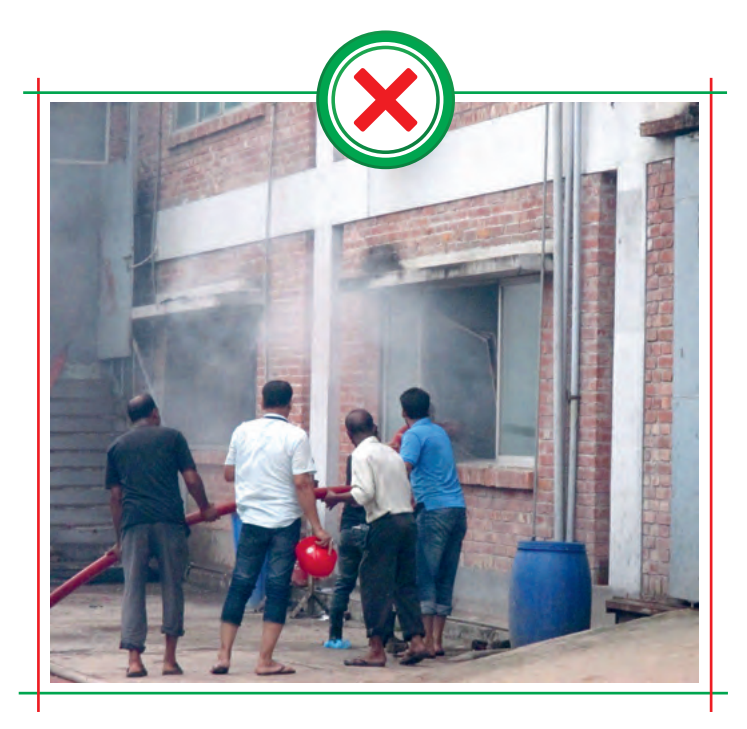
You are not a fire fighter! When you hear the fire alarm, do not try to fight the fire. Do not try to put out the fire.